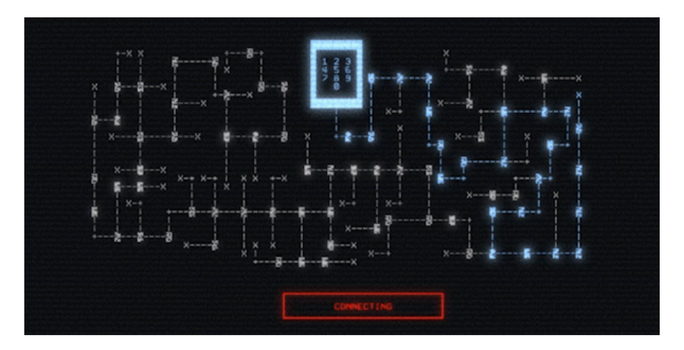
The world of the electron and the switch

An intuitive retro-cyberpunk text interface inspired by classic hacking movies takes you back to an earlier vision of the internet. An original electronic soundtrack by Lena Raine and Ryan Ike gets you in the zone.